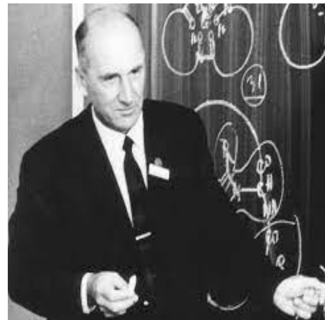
1975 Nobel Prize in chemistry for his research into the stereochemistry of organic molecules and reactions

Develops the synthesis of sulfonamibiotics and chemotherapeutics